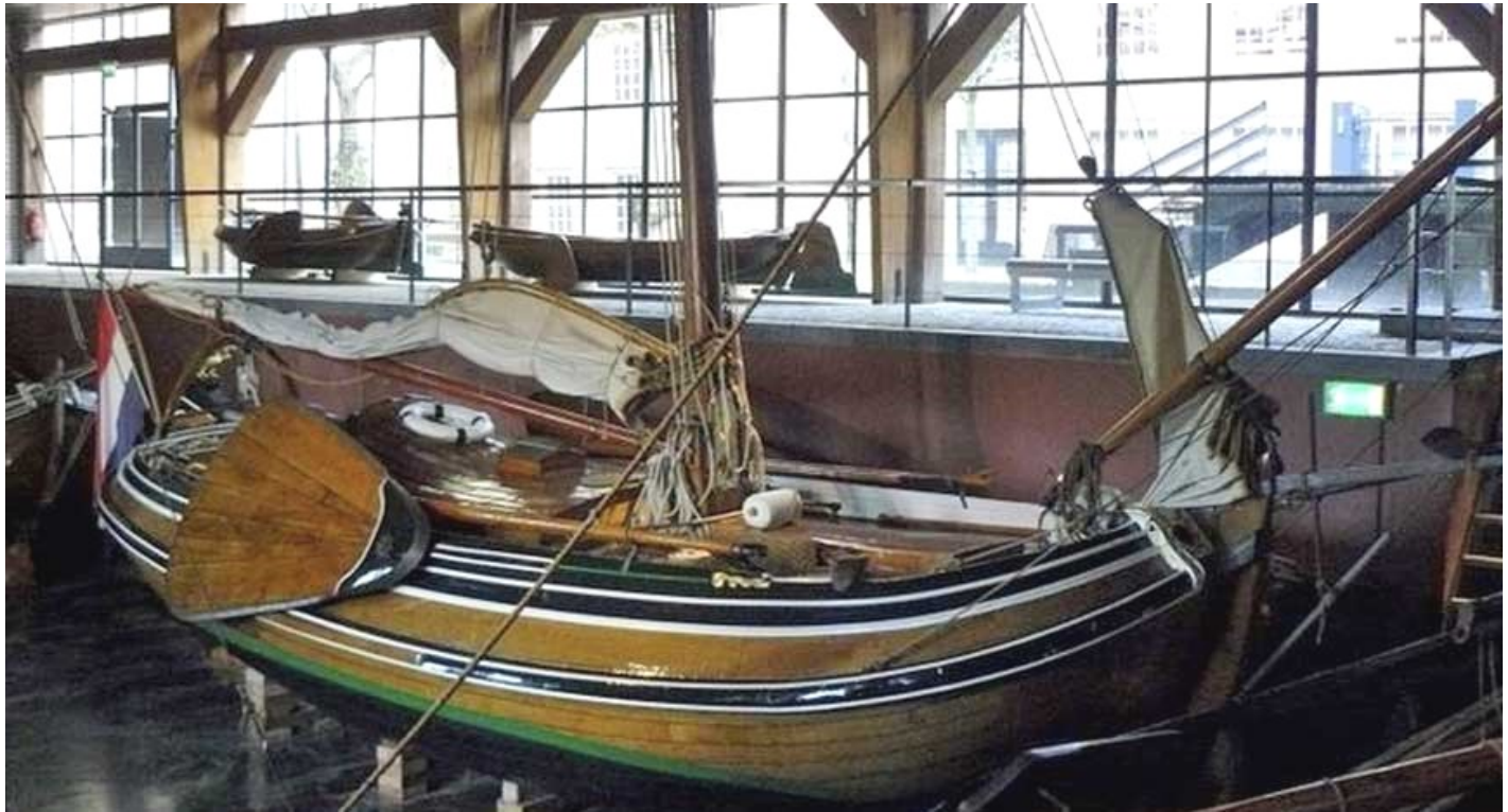
Sperwer (Sparrow Hawk)

31 ft. (9.5 m) LOA - 27 ft. (8.3 m) WL - 10 Tons - 1,000 sq.ft. (93 sq.m) Sail Area