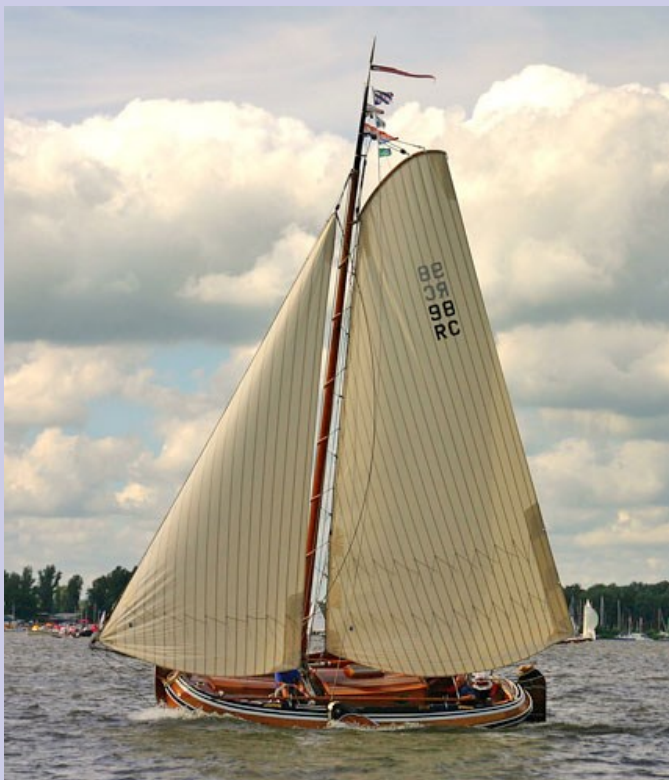
Albatross , built in 1881, is very similar to Sperwer