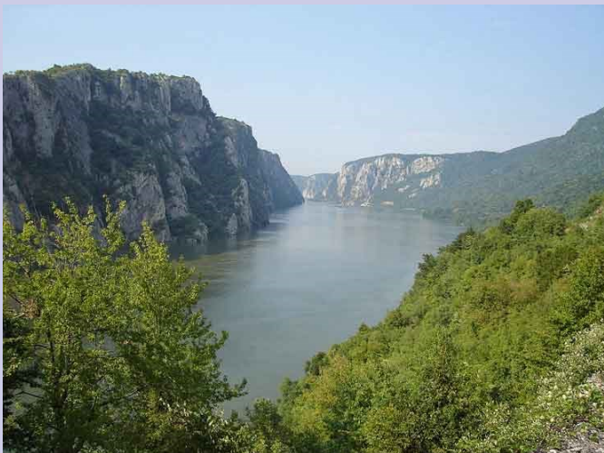
The Iron Gates gorge on the Danube

Ultimately, the plan to sink boats in the Danube was abandoned because the Germans apparently siphoned the fuel out of the boats of Minshall's little fleet. The small flotilla ran dry, and—dead in the water—they and Minshall's men were captured. Minshall escaped in his launch, which was following behind. Filling the launch with explosives, he then ran it at top speed into a rail-