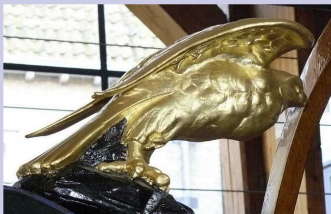
The sparrow hawk carving on Sperwer's rudderhead